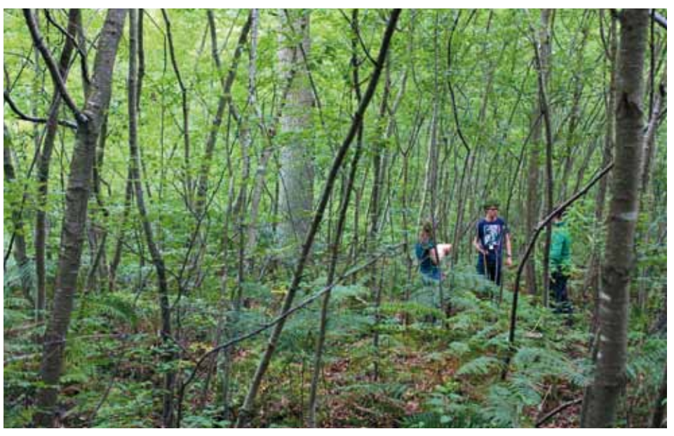
Forest of Compiègne with Prunus serotina in the undergrowth.

remote sensing data allow conclusions to be drawn with respect to the nutrient content of leaves, composition of species communities, and their photosynthetic activity."