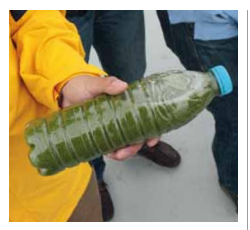
A surface water sample reveals the concentration of algae.

Lake Taihu is the third biggest freshwater lake in China. It is the drinking water source for about ten million people in the region and one of the most highly polluted water bodies in China. Wastewater flows from several cities with over one million inhabitants each enter the lake uncleaned or insufficiently cleaned together with fertilizers and pollutants from agriculture and industry.