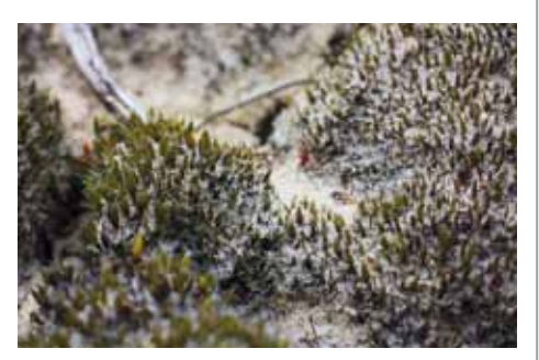
Moss species Campylopsus introflexus on Sylt.

For this, Michael Ewald combines field work with the evaluation of spatially and spectrally highly resolved remote sensing data measured by aircraft in summer 2014. He uses hyperspectral images and laser scanning data. "With the laser scanning data, we can exactly determine the height of vegetation, the density of foliage, and the plant biomass," Ewald says. "Hyperspectral