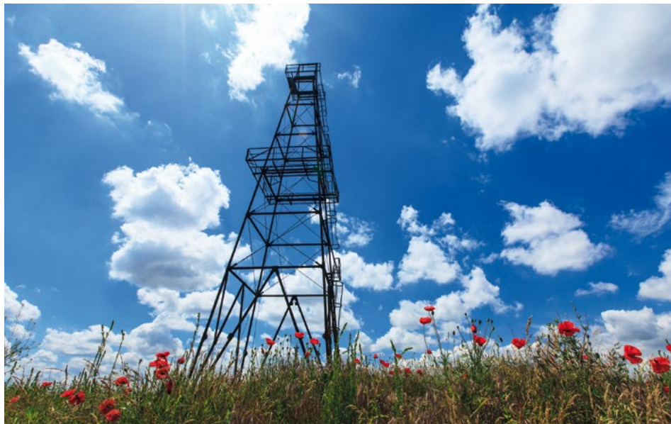
Opponents of fracking fear that the chemicals used for drilling will contaminate the environment.